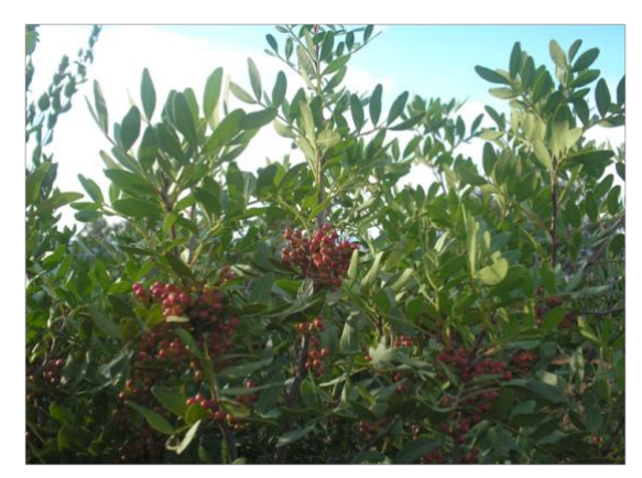
Figure 9 . Female plant of Pistacia lentiscus.

Based on the inflorescences, farmers can distinguish "non-productive" male lentisk trees from "productive" female lentisk trees (Fig. 9); it is then easy to locate areas and/or stations rich in lentisk before the harvesting season.