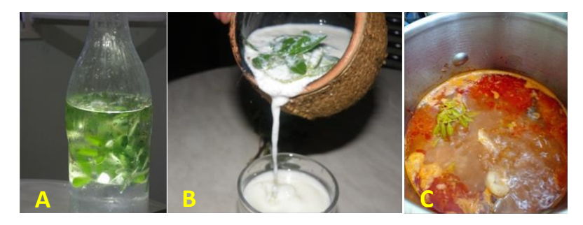
Figure 19. Uses of lentisk leaves as an ingredient in food: drinking water (A), fermented milk (B); in the dishes (C).

Lentisk tree leaf extracts consist of several families of compounds such as flavonoids, anthocyanins, phenolic acids (gallic acid, digallic acid, catechin), triterpenoids and tannins. These constituents are responsible for the leaves' antioxidant and anti-inflammatory activity.