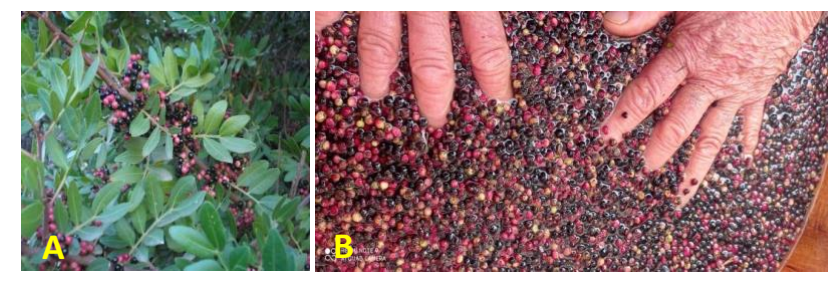
Figure 6. Lentisk twigs with ripe drupes (A) (Credits – M. Sebti), cleaning of the lentisk drupes (B) (Credits - N. Boulamdaouar, 2022).

After picking, the ripe berries are cleaned and then washed (Fig. 6) before they are crushed. Harvesting may take a few days, so before crushing, the fruit should be spread out on a clean surface and allowed to dry at room temperature to avoid contamination. Artisanal oil extraction requires adequate equipment, which all households should have, namely a grinding stone and a mortar (Fig. 7), depending on the region.