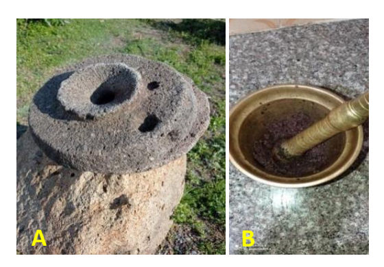
Figure 7. Other lentisk oil extraction tools: millstone (A), copper mortar (B).