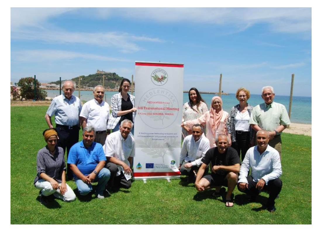
Project team (Closing meeting of the project – Tabarka / Tunisia)