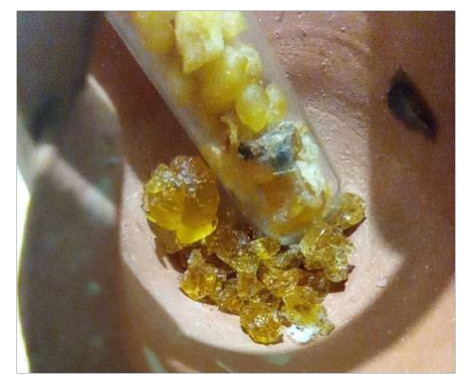
Figure 17. Lentisk tree resin.

The aerial parts of the lentisk tree or its resin are traditionally used for the treatment of coughs, throat ulcers, eczema, stomachache, kidney stones, and jaundice.