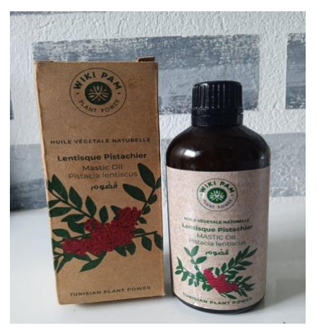
Figure 12 . Commercial bottle of lentisk oil (Credits – F. Mezni).

Like most fixed oils, the quality of lentisk oil can deteriorate over time. This is the phenomenon of oxidation, which is the result of exposure to air, light and heat. To minimize the oxidation of the oil, it is imperative to use dark glass bottles with sealed caps and a label indicating the origin of the oil and the date of extraction.