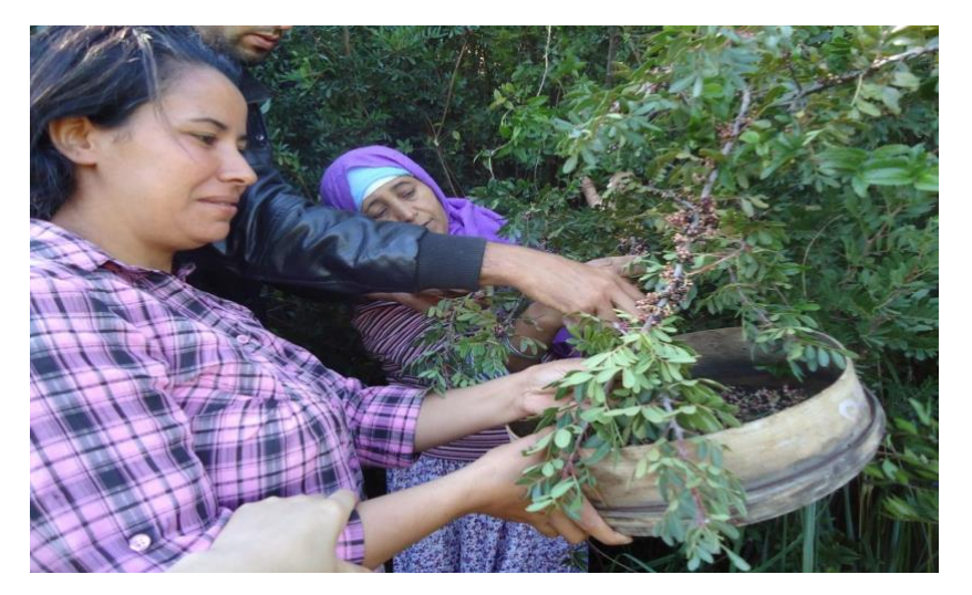
Figure 10. Non-destructive harvesting of lentisk fruits (Credits - F. Mezni).

Healthy harvesting is still done by hand; the use of tools such as sticks, and destructive cutting of branches and twigs is not recommended. The harvest should be cleaned with water.