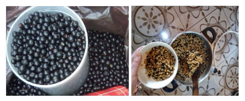
Figure 14. Traditional Tunisian dish (sliga) (Credits - M. Sebti; F. Mezni).

Its fruit can also be used in the preparation of traditional dishes. It has also been studied in the laboratory for its antioxidant, anti-inflammatory, cytoprotective and anti-cancer activities.