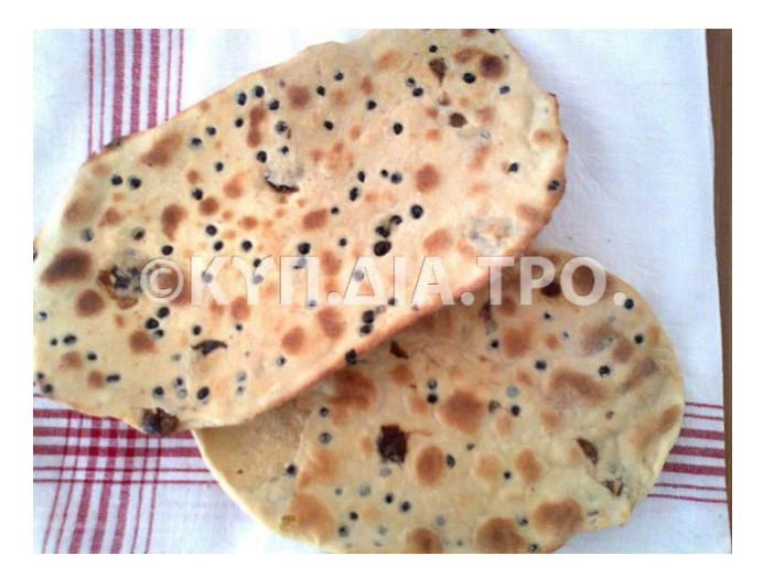
Figure 16. Traditional pies with fruits of lentisk from Cyprus (siinopites)

On the other side of the Mediterranean basin, to the East, this plant is not that commonly used but there are some traditional recipes reported in Cyprus (Cyprus Food Virtual Museum) and in Greece (Kasos, Naxos and Crete islands) for the use of the fruits of the lentisk tree soaked in water for making the traditional bread and pies (\sigma \iota \eta v v \dot{\sigma} \mu v \dot{\sigma} \iota \eta v v \dot{\sigma} \pi \iota \tau \epsilon \varsigma: 'siinopsomo'/'siinopites') and sweet cookies.