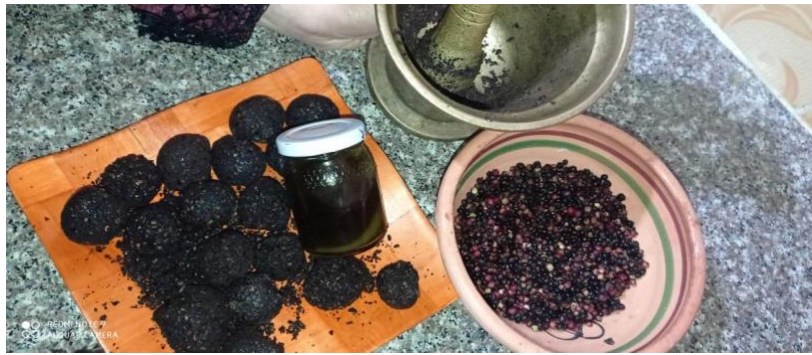
Figure 8. Extraction of lentisk oil using the mortar.

Figure 7. Other lentisk oil extraction tools: millstone (A), copper mortar (B).