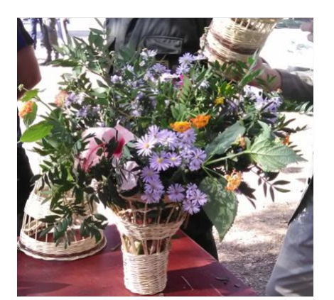
Figure 18. Bouquet of flowers with twigs of lentisk tree.