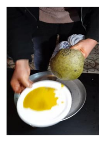
Figure 4. Fixed oil of Pistacia lentiscus

The extraction of lentisk oil is a traditional activity. By traditional method, this oil is prepared for therapeutic purposes, notably in the treatment of burns and respiratory diseases. The extraction is very old and practiced by women, who pass it on from one generation to the next; it is based on non-ergonomic techniques; it is a long and arduous traditional process giving a low yield of around 5%. The extracted oil is also characterized by a poor quality affected by direct and repeated exposure to high temperatures (Mezni, 2019).