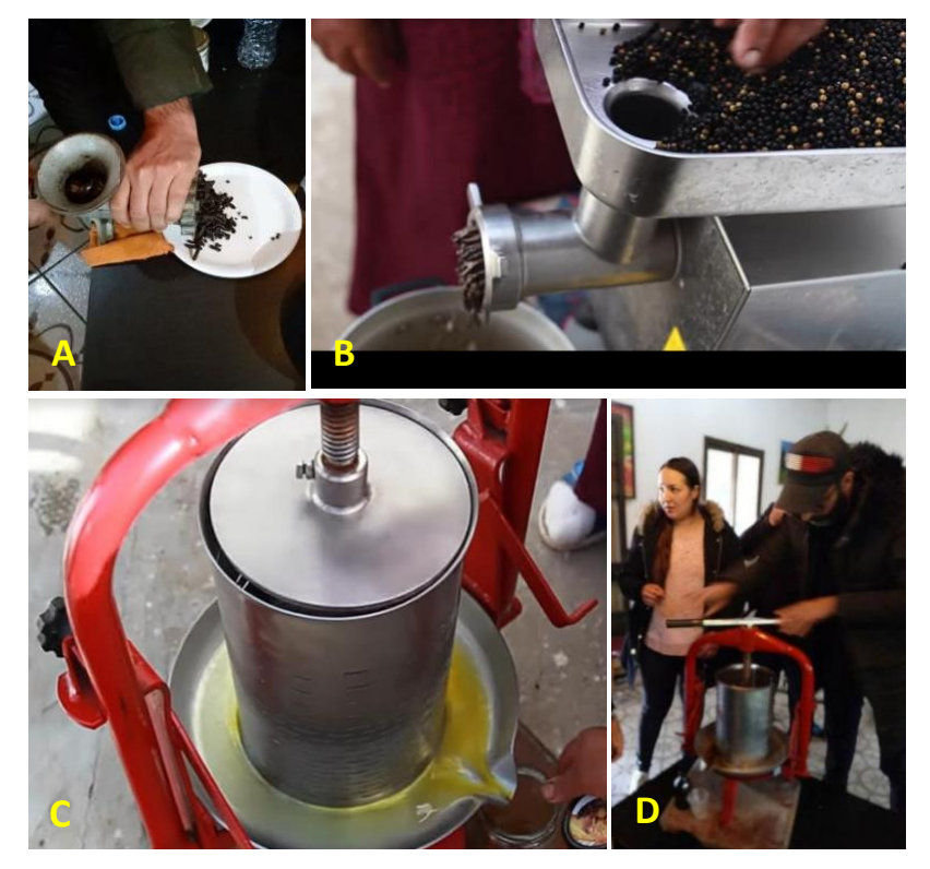
Figure 11. Modern extraction equipment: manual chopper (A), electric chopper (B), hydraulic press (C), demonstration (D).

As an alternative technique to traditional crushing (by stone or mortar), a manual or electric chopper and an electric press made of stainless metal are adequate and allow for better oil quality and yield (Mezni, 2019; GIZ, 2018). New extraction methods that are less arduous, more practical and efficient, and more profitable and productive in terms of quality and quantity, are gradually being introduced.