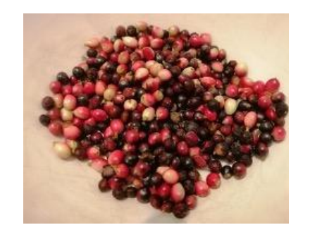
Figure 2. Not ripe drupes of P. lentiscus.