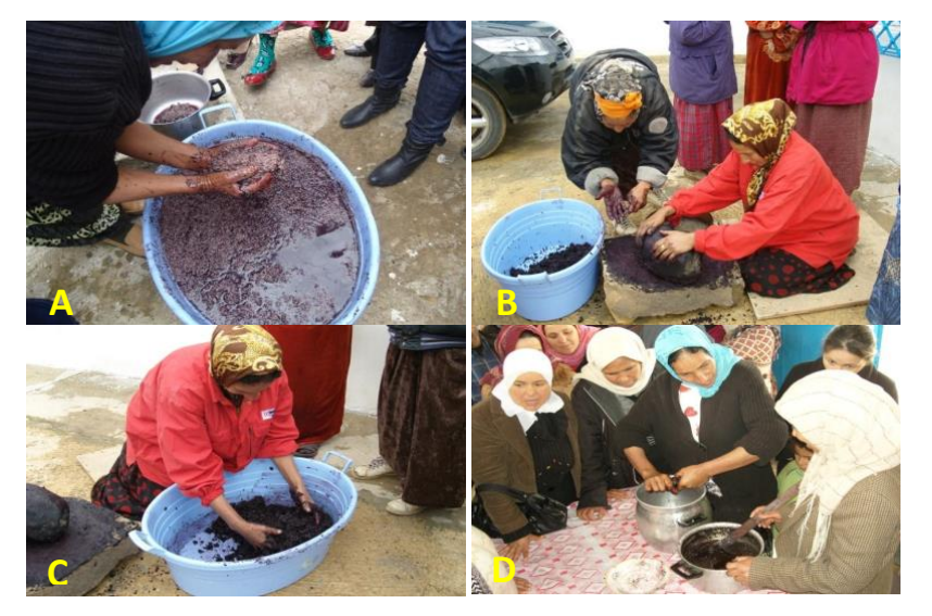
Figure 5. Extraction of fixed lentisk oil by the artisanal method in Tunisia: crushing (A), mixing (B), skimming (C), pressing (D).