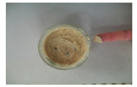
Figure 20. Ash-based soap.

The wood of the lentisk tree is particularly hard and is used in cabinet making, carpentry and as firewood. A wood veneer test was carried out by Forêt Modèle de Provence for use in marquetry, and the test proved successful. The wood can make excellent charcoal, and the ash can be used in soap making.