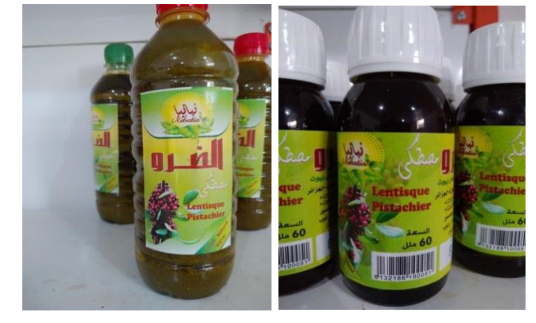
Figure 13. Lentisk oil from Nabatia El Milia.

The oil is transformed into several products to be marketed in the form of oil, cream, soap, balm, and shampoo. These various lentisk oil-based products are marketed in the herbalist's shops. The preparation methods and therapeutic indications are similar and/or inspired by traditional recipes reported by rural populations (Beldi et al., 2021).