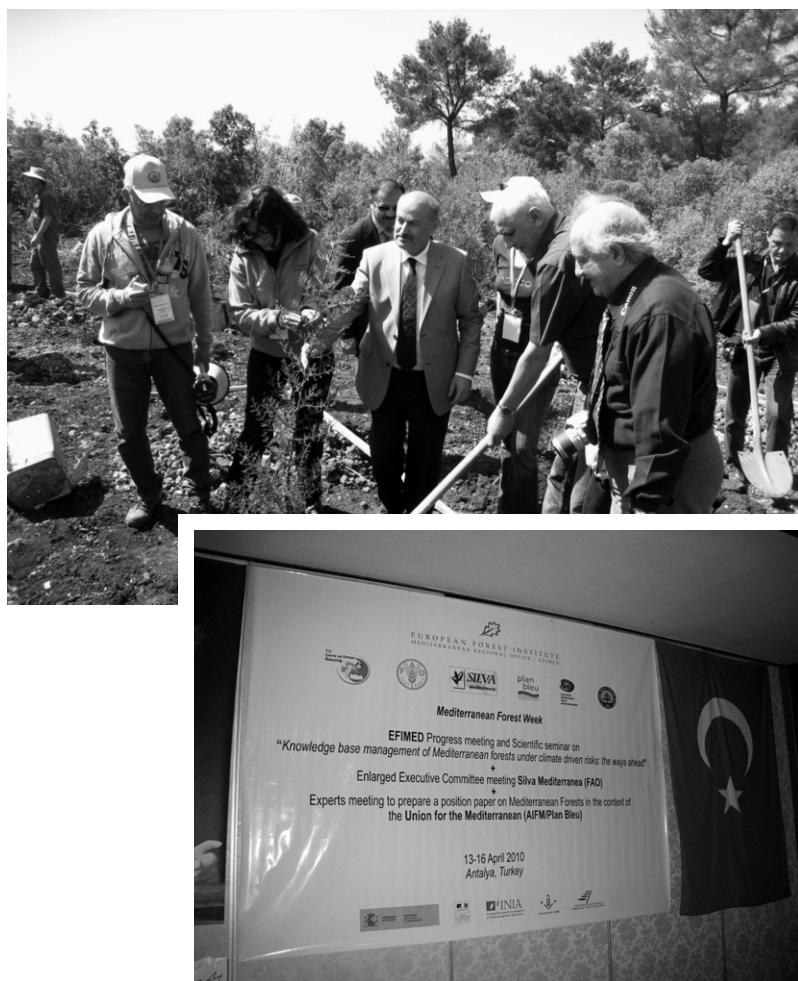
Pictures 1: The 1 st Mediterranean Forest Week in Antalya, Turkey, 2010.

– a workshop to prepare a position paper for the ministers of agriculture of the Union for the Mediterranean.