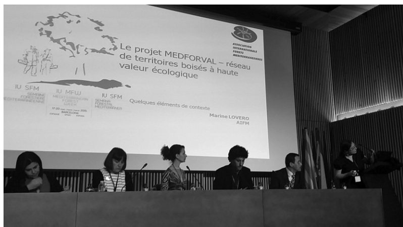
Picture 4: The “Medforval project” workshop during the 4 th Forest Week Mediterranean. Barcelona, Spain, 2015.

change?” and the various sessions illustrated this theme. The program was detailed and presented in a quality information booklet for participants;