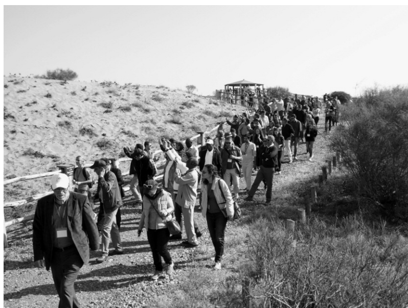
Picture 5: Field trip during the 5 th Mediterranean Forest Week. Agadir, Morocco, 2015.

The high-level segment met on March 20 th and adopted the “Barcelona Declaration”, which took note of the decisions taken by the member States of the Committee two days earlier and approved them. Implementing these decisions “will provide a new impetus and a renewed framework for countries in the region to collaborate and work together on Mediterranean forest issues”.